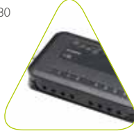
prismaPSG – WM 29690 PSG Module